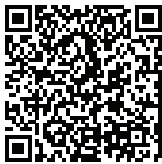
FDS / SDS / DoP Product information